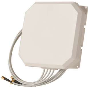
Patent Pending PSQ24495

Enclosed in a compact/low profile ASA, UV stable, radome and equipped with an articulating arm that can be affixed to a mast or anchored directly to a vertical surface, the antenna can be oriented to take full advantage of the antenna's directionality. Uniform and symmetrical radiation patterns provide a high-level signal density into defined coverage zones. This antenna will greatly enhance the performance of 802.11n systems where physical obstructions are anticipated. The dual band frequency coverage means that a single type of antenna can be deployed with any MIMO radio in the 2.4- 2.49 MHz and 4.9-6.0 MHz bands.